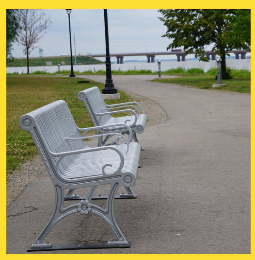
The trail connecting Lakeshore Park Riverwalk to Oshkosh Avenue, through Rainbow Memorial Park, is completed.