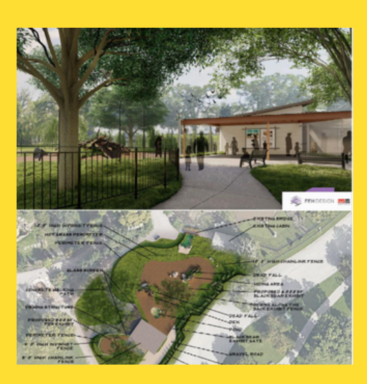
The designs for a new Menominee Park Zoo bear and fox exhibit were being developed.