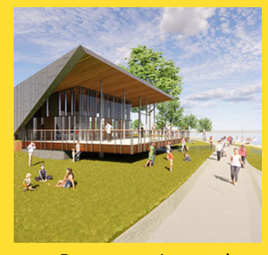
Progress continues at the redevelopment of Lakeshore Park. Designs were completed for the four-seasons building. Construction will start in spring of 2022.