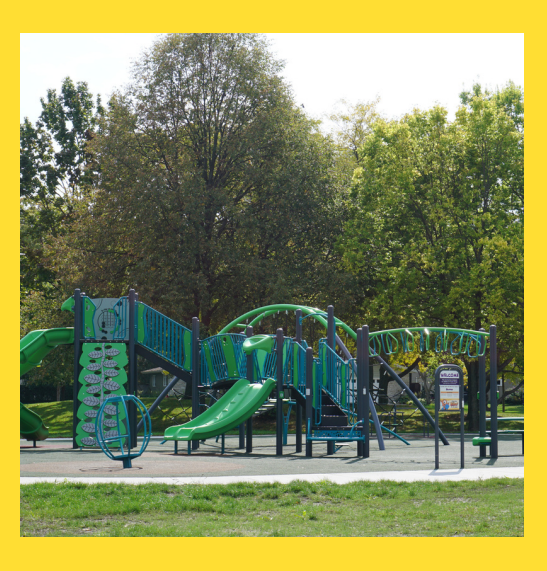
The Westhaven Circle Park new play equipment with accessible routes and resilient surfacing is completed.

The new building will allow space for all parks employees to work at the same building and house all equipment, making operations more efficient.