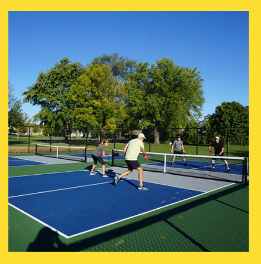
The South Park reconstruction of tennis courts with new pickleball courts is completed.