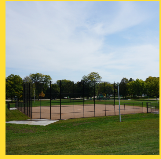
The Westhaven Circle Park reconstruction of the youth ball field is completed.