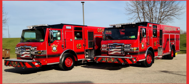
New engines for Station 15 & Station 19

The mission of the City of Oshkosh Fire Department is to prevent, respond to, and to minimize harmful situations to the people we serve.