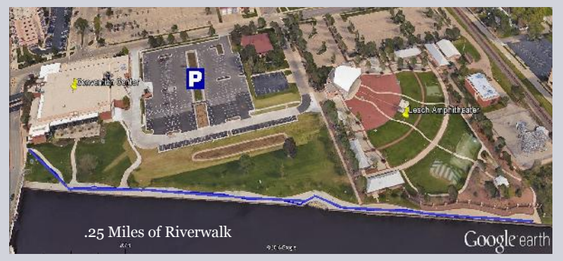
Main Street to Jackson