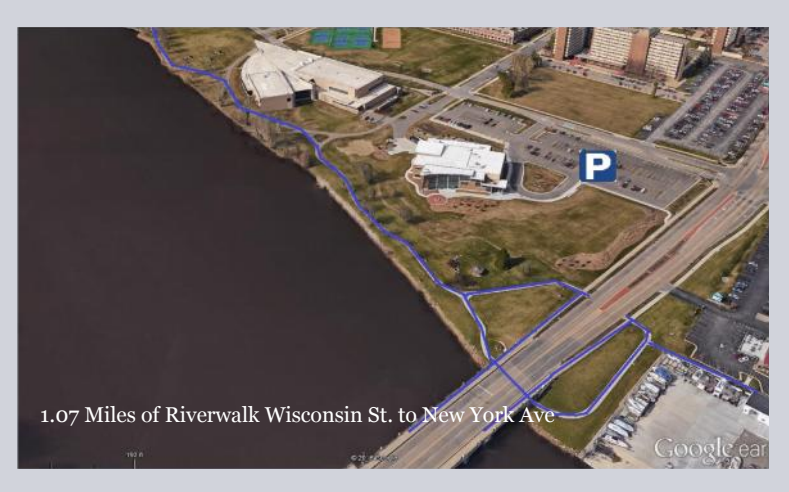
Oshkosh Senior Center