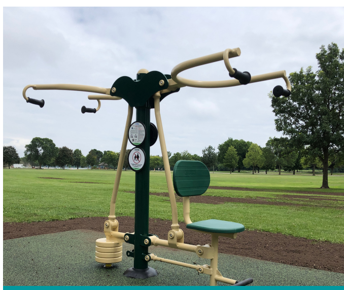
Menominee Park outdoor exercise stations installed