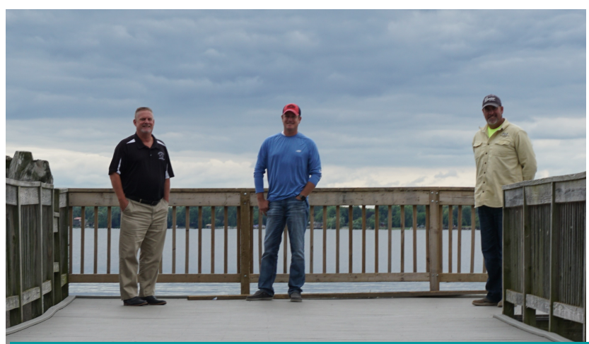
Bowen Street Fishing Dock is refurbished