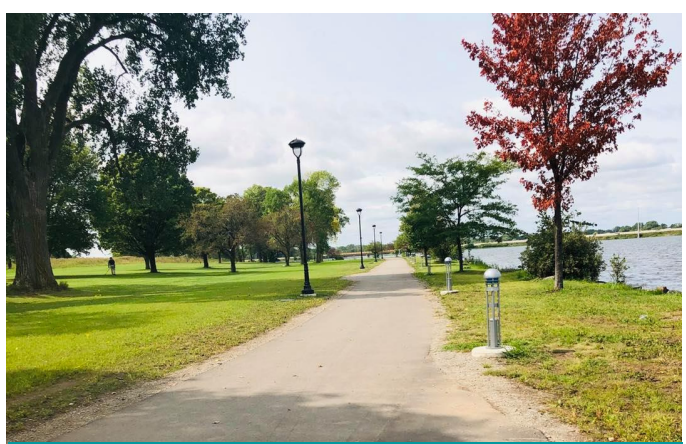
Lakeshore Park Riverwalk is completed