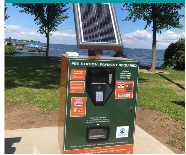
Solar powered electronic pay stations are installed at boat launches