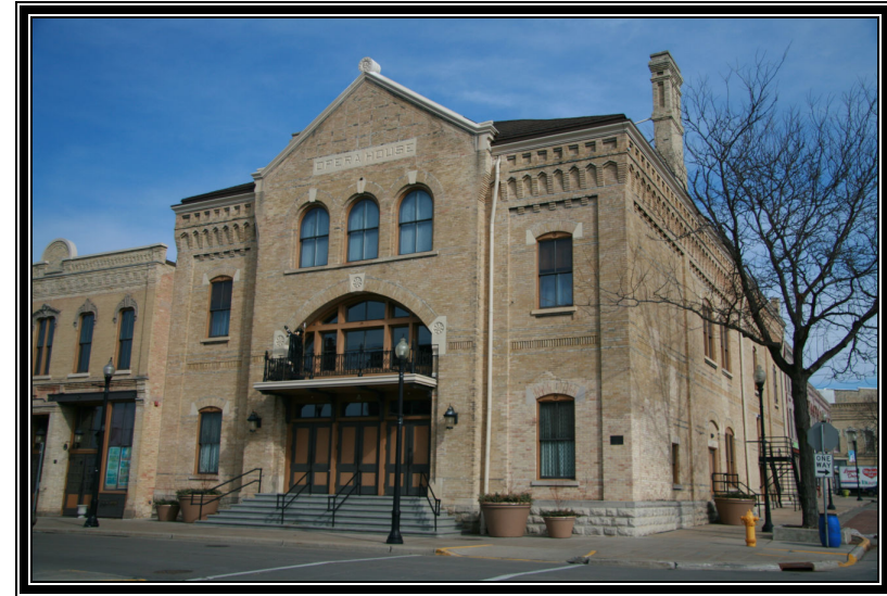
Grand Opera House – 1883

with this District. The City of Oshkosh Landmarks Commission hopes that these examples will stimulate a sense of discovery, appreciation, and imagination as the viewer strolls through this historic area.